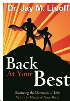
Chiropractic & Physical Therapy, LLC, which is